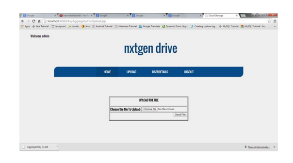
Figure 2: Admin uploads the required file to the requested user