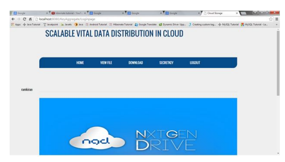
Figure 3: user can view the list of files send by the admin